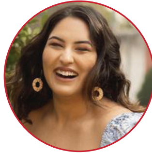
Sakshi Sindhwani Social Media Influencer