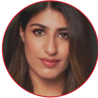
Shreya Mehta Actress, Model & YouTuber