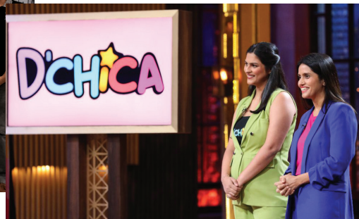
Pearl alumni in Shark Tank India